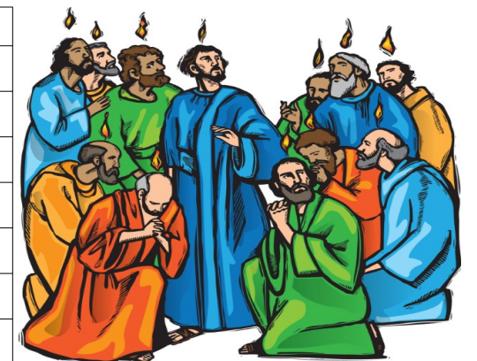
The Holy Spirit Descends on Pentecost